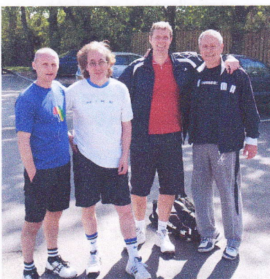
Our famous Vets 2 finalists!

Mens Vets 2 beat Parklangley Mens Vets 2 by 3 rubbers to 1.